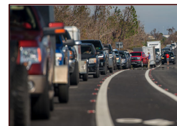
The picture on the left shows members and families returning to Tyndall AFB after Hurricane Michael in 2018